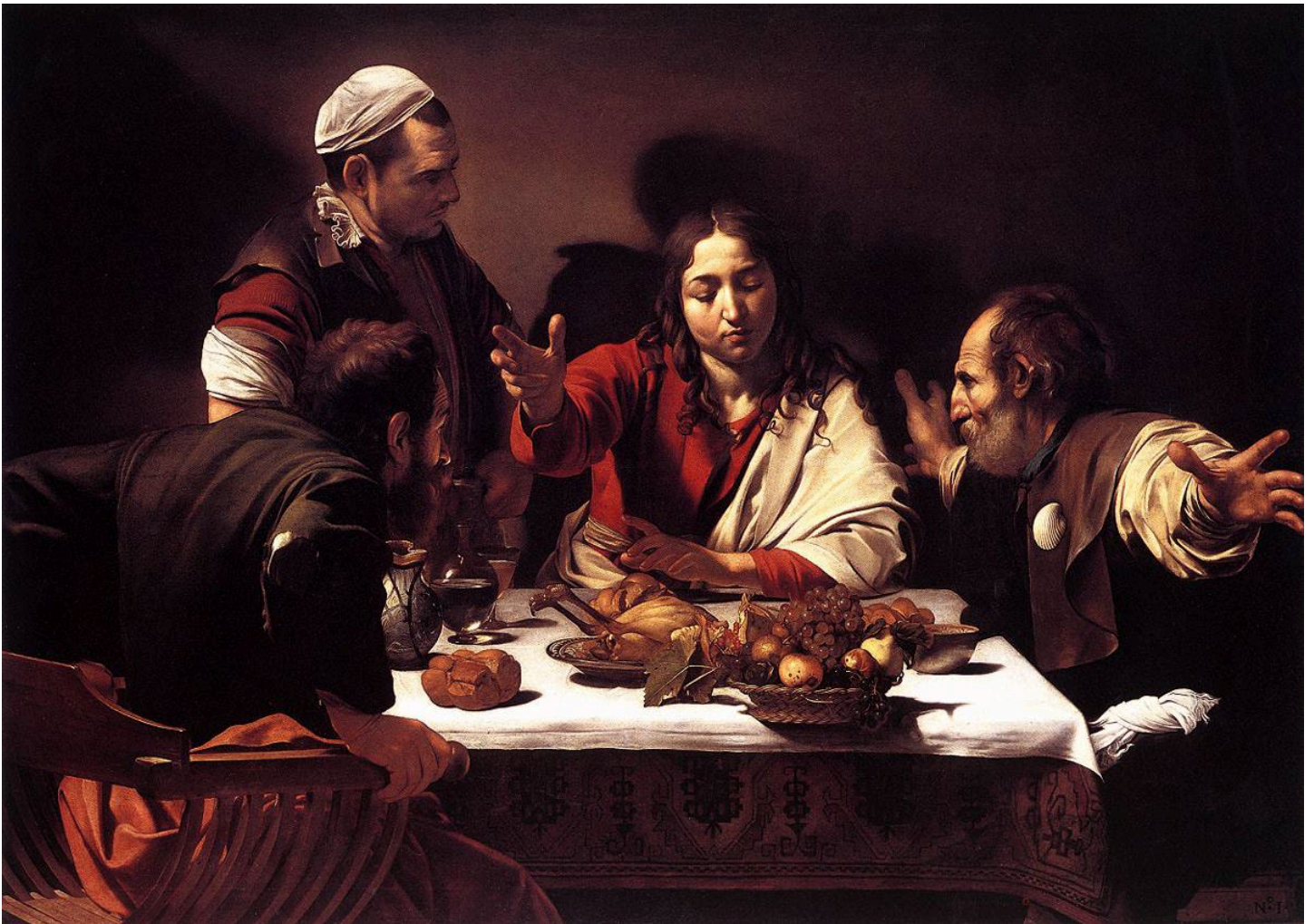
The Supper at Emmaus, Michelangelo Merisi da Caravaggio, 1601 National Gallery, London