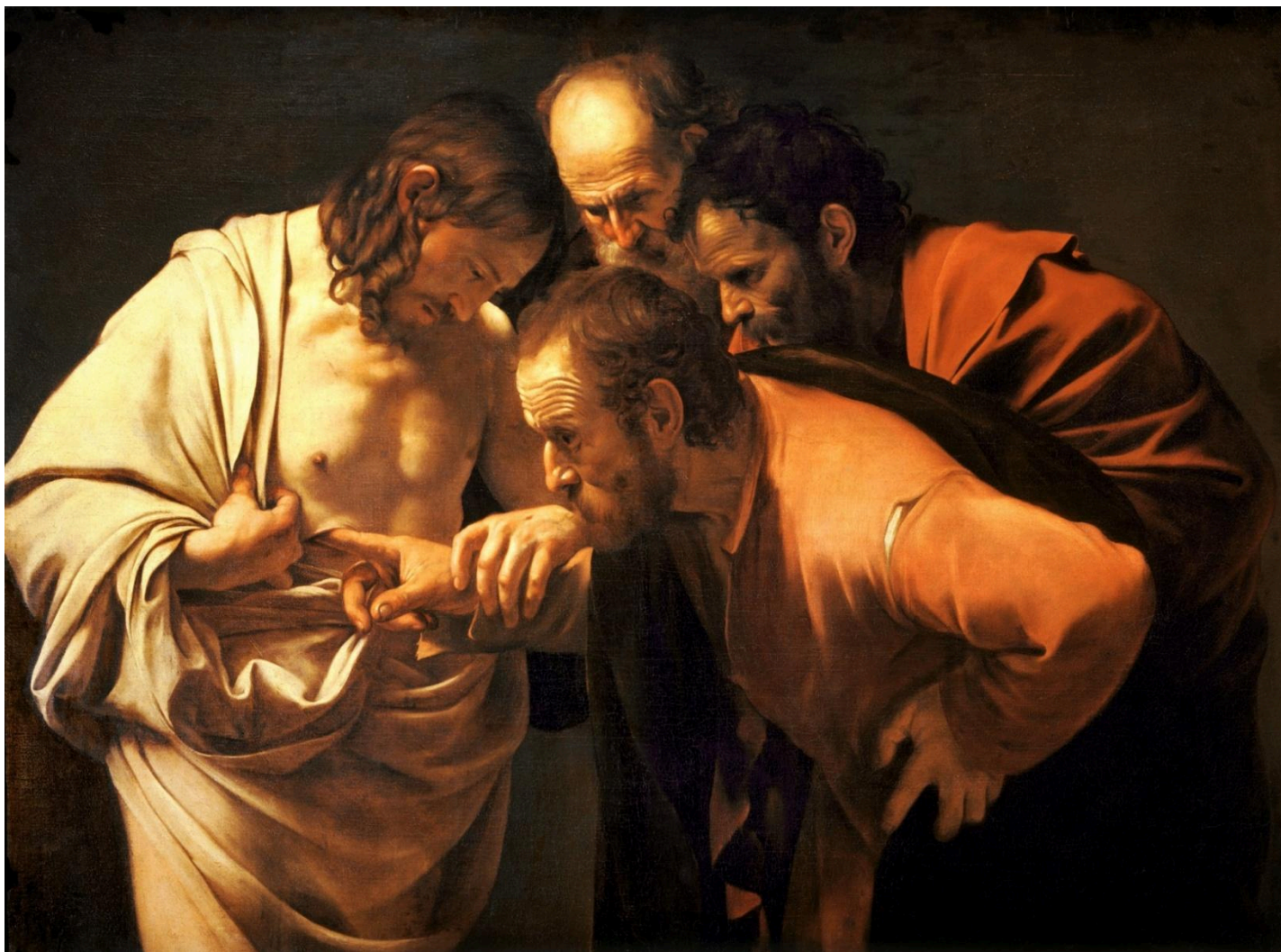
The Incredulity of St Thomas, (c. 1601–2) (Michaelangelo Merisi da) Caravaggio (1571–1610)