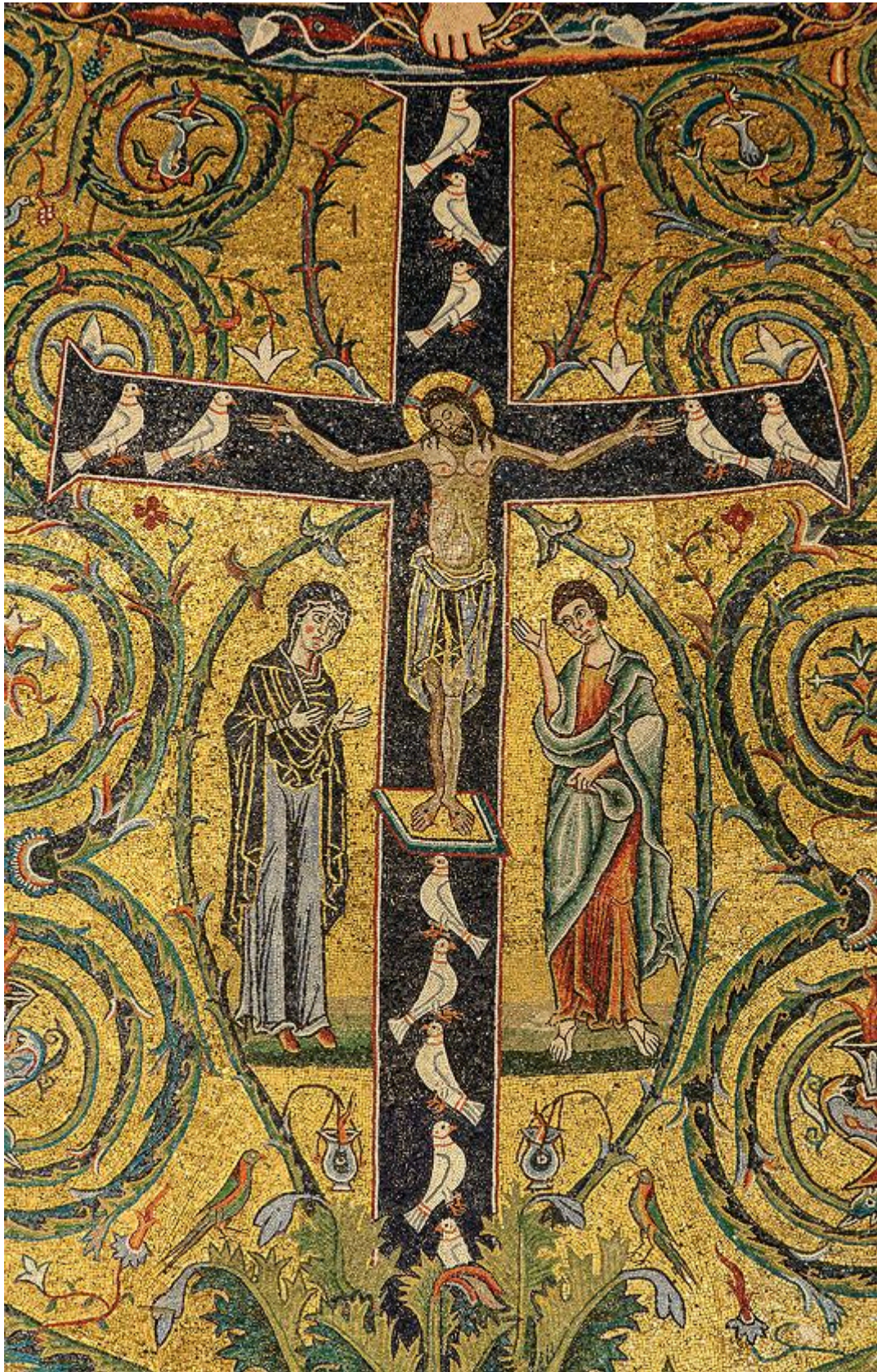
Apse Mosaic, c.1200 Basilica San Clemente al Laterano, Rome