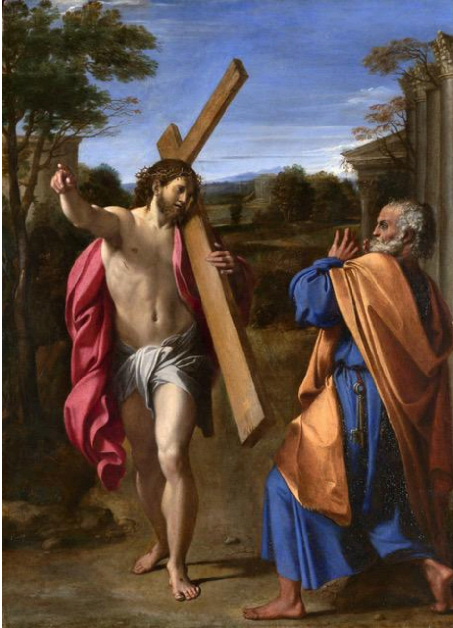
Annibale Carracci (1602). Domine, quo vadis? , National Gallery, London