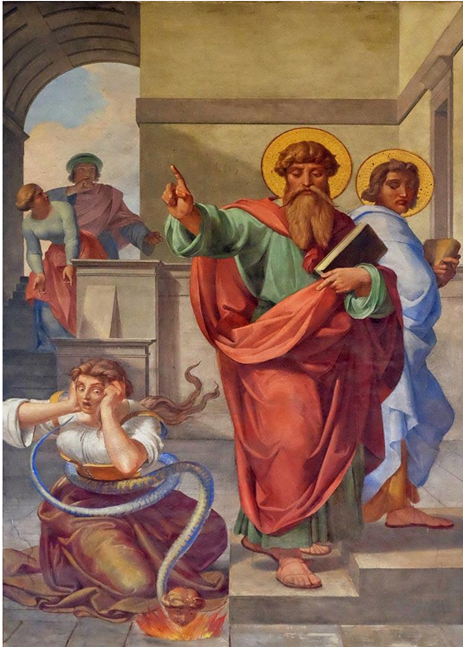
The Exorcism of the Slave Girl, fresco, the basilica of Saint Paul Outside the Walls, Rome Pietro Cavallini (1277–79)