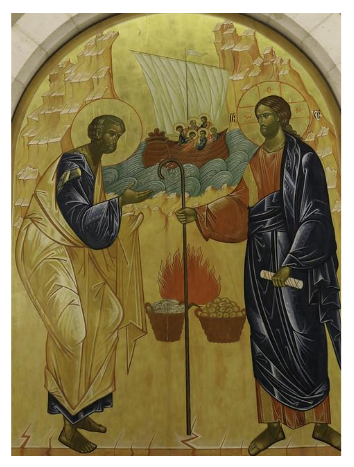
"Feed my sheep" Icon from the church of St Peter in Gallicantu, Jerusalem