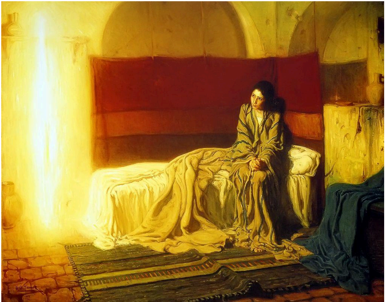
The Annunciation (1898) Henry Ossawa Tanner (1859–1937) Philadelphia Museum of Art

Advent Sunday, 1 st December, 2024 6:00 p.m.