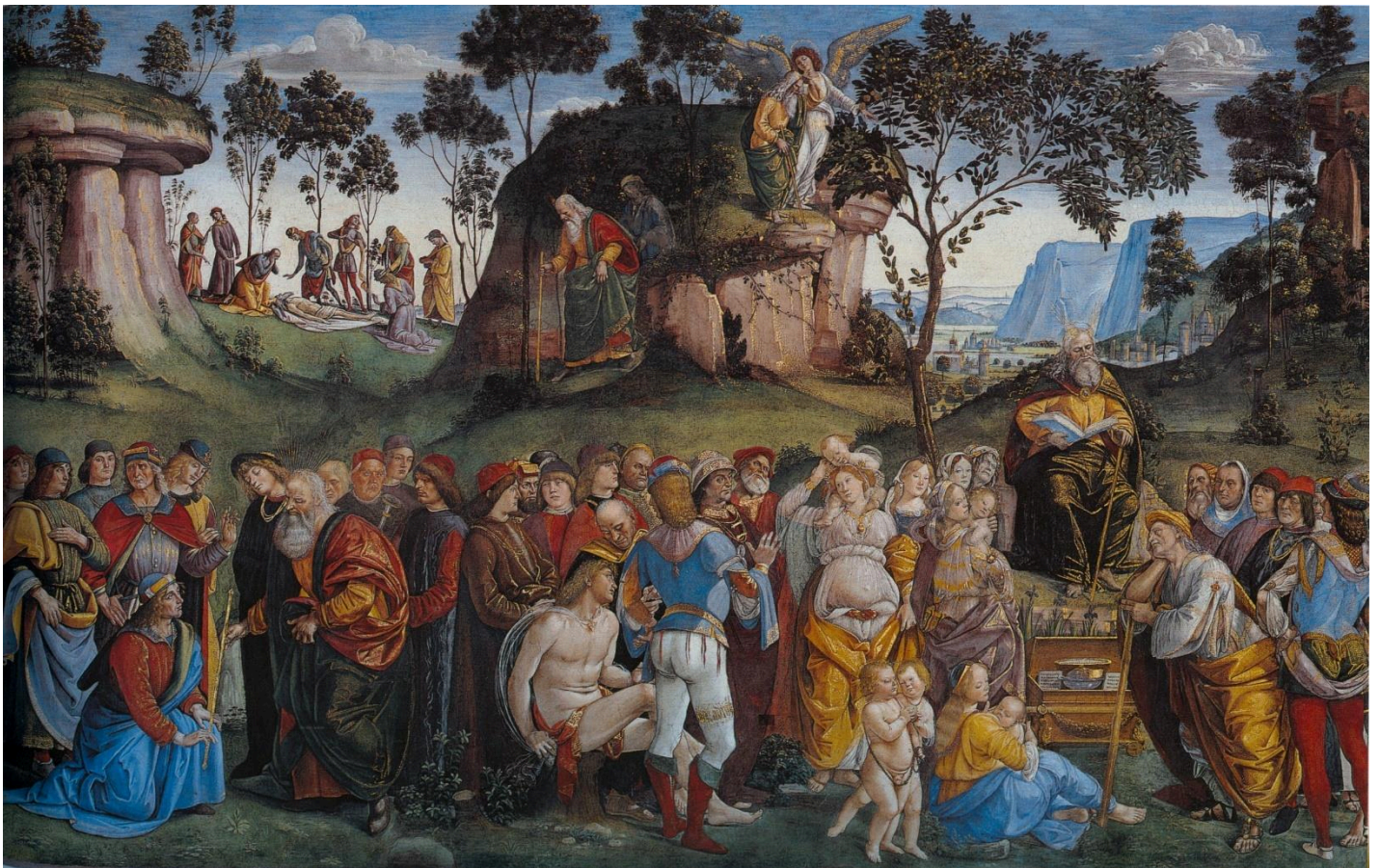
Signorelli, Luca and della Gatta, Bartolomeo Testament and Death of Moses , Fresco, 1482, Sistine Chapel