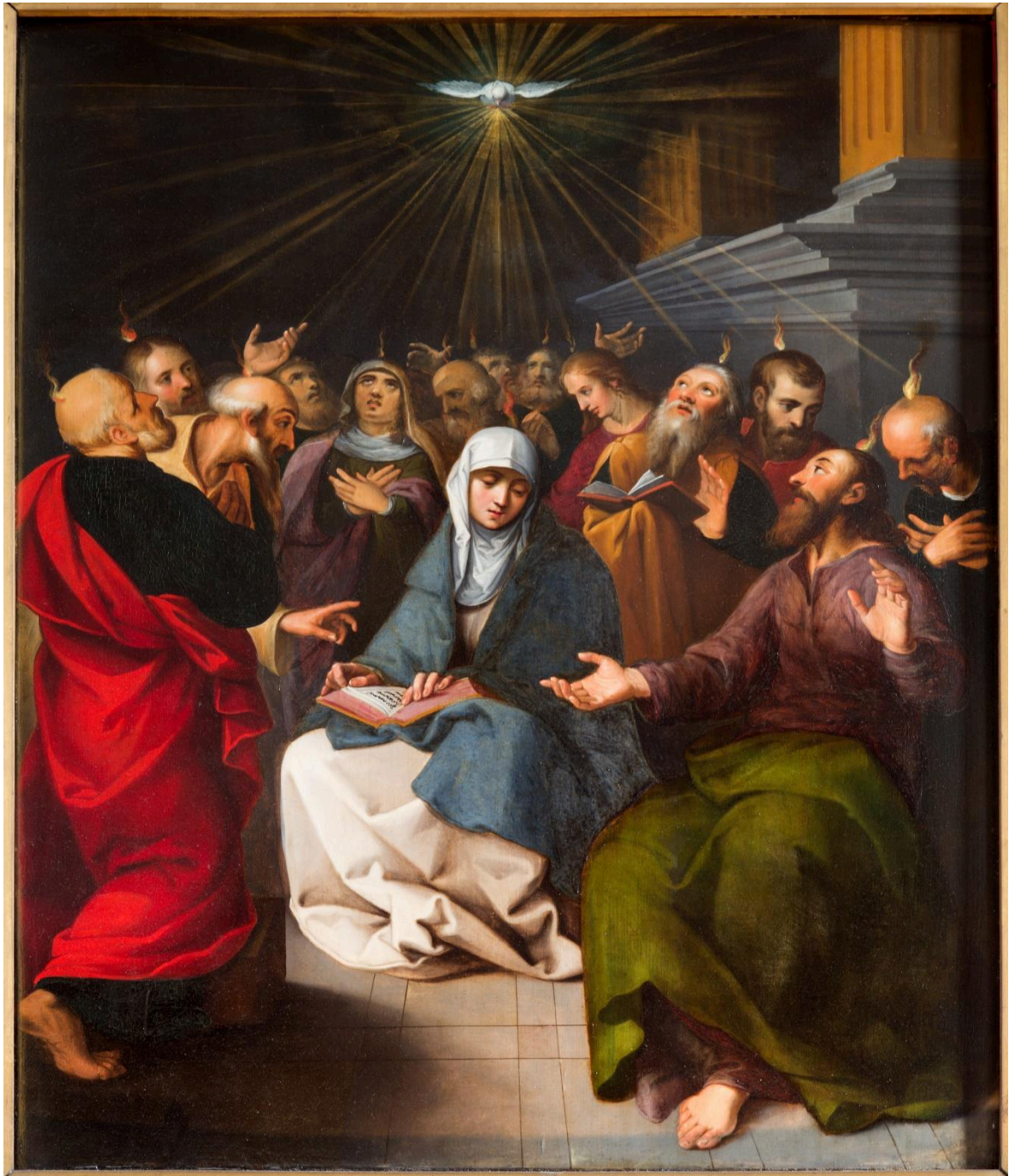
Pentecost, Cathedral of Our Lady, Antwerp, Belgium