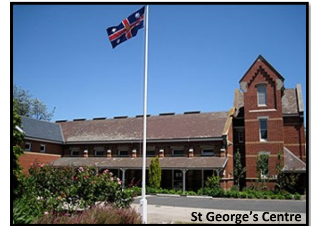
St George's Centre

A great venue to host your next meeting, function or training session